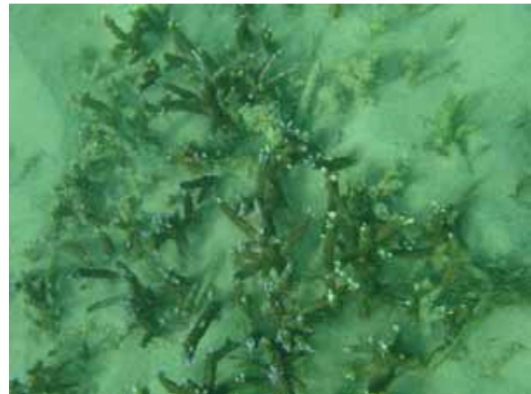
Corals buried in sand.

The tsunami moved millions of tons of sand. Beaches were reduced by 75 percent in seconds. Much of the sand ended up on the reefs and, throughout the region, reefs have been fully or partially buried. In the Maldives, we observed that one reef, a monitoring site for scientists that was previously at ten meters, has been buried under three meters of sand. Reefs in Trincomalee and Phi Phi have been partially buried under meters of sand.