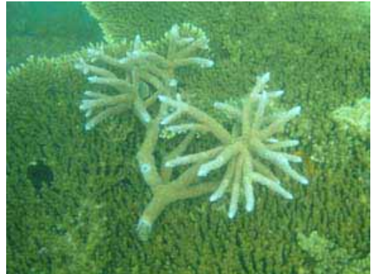
Coral broken by the tsunami.

Currently, TRAF is supporting six major efforts in Thailand and Sri Lanka, and several other smaller ones. The Fund has supported local people who were left homeless and without income by the tsunami. TRAF has sent scientists to help these communities with clean up and restoration and has sent divers to assist with debris removal. It has provided scientific knowledge and appropriate techniques to restore damaged and broken reefs.