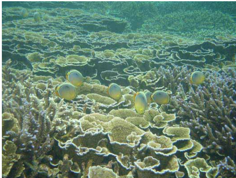
Angelfish swim in the "rainforest of the sea"

We acknowledge and commend the energy and commitment of the scientists who responded quickly to the crisis and of the local individuals and groups (many of whom lost everything in the tsunami) who despite great hardship are working to rebuild their lives and the marine environment.