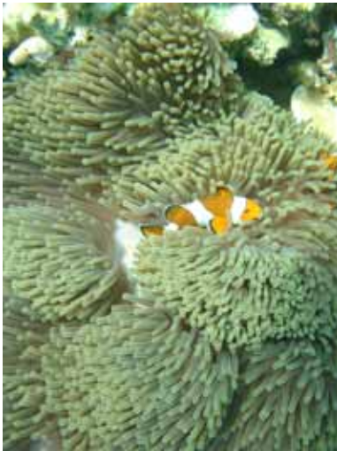
Clown fish live among coral reef anemones.