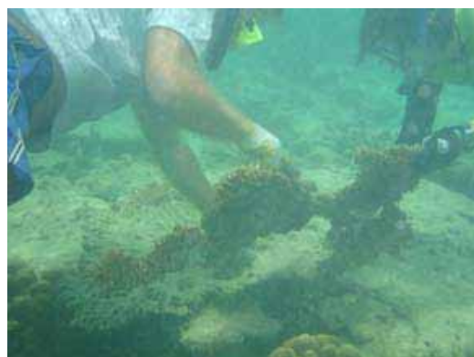
Divers righting pieces of coral.

Simple remedies can be used to repair damaged reefs. These techniques can save corals and preserve the integrity of the reefs. Repairing massive cracked colonies, reattaching detached coral colonies directly with epoxy or marine cement, can be an effective local treatment to help