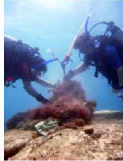
Divers remove debris from coral.