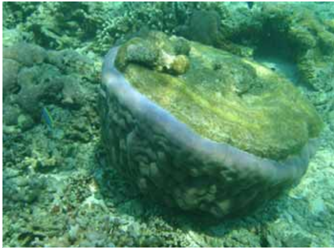
Overtuned coral head.

Extensive areas of coral reef were damaged by the tsunami (Edwards, GEF/World Bank 2005; Brosnan 2005). Shortly after the tsunami, initial reports of severe damage and reef destruction were received from several countries including Thailand, Sri Lanka, Indonesia and India. Data are still being analyzed but initial figures are available (see table on page 21). The emerging