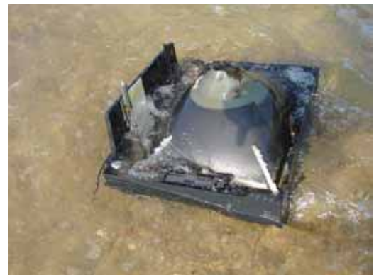
TVs and other debris pose serious problems.

The receding waves dragged debris onto the reefs and seafloor and created a major environmental and human safety crisis. TV sets, cars, fridges, corrugated metal, entire houses and their contents, and sheet rock all ended up on the reefs and sea floor. Additionally, large trees and other land vegetation were deposited on reefs. The damage continues – with each wave, the debris is rolled on the coral heads and causes more destruction. Fishing nets were dragged onto the reef and wrapped around corals where they continue to trap fish, threaten endangered turtles, and break fragile coral heads. The monsoons have worsened the situation by uncovering more debris and tossing it on the reefs and beaches.