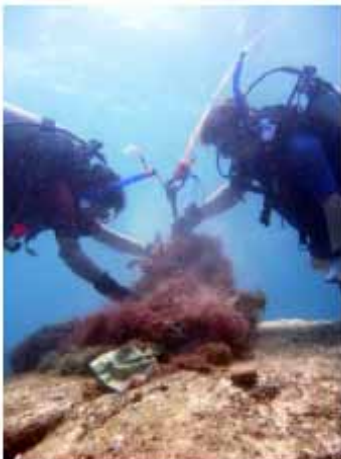
Divers remove debris from coral.

Currently, TRAF is supporting six major efforts in Thailand and Sri Lanka, and several other smaller ones. The Fund has supported local people who were left homeless and without income by the tsunami. TRAF has sent scientists to help these communities with clean up and restoration and has sent divers to assist with debris removal. It has provided scientific knowledge and appropriate techniques to restore damaged and broken reefs.