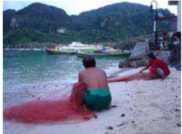
Family tries to return to fishing.

The response to the environmental and humanitarian disaster will be most effective if it occurs at several levels. These include: