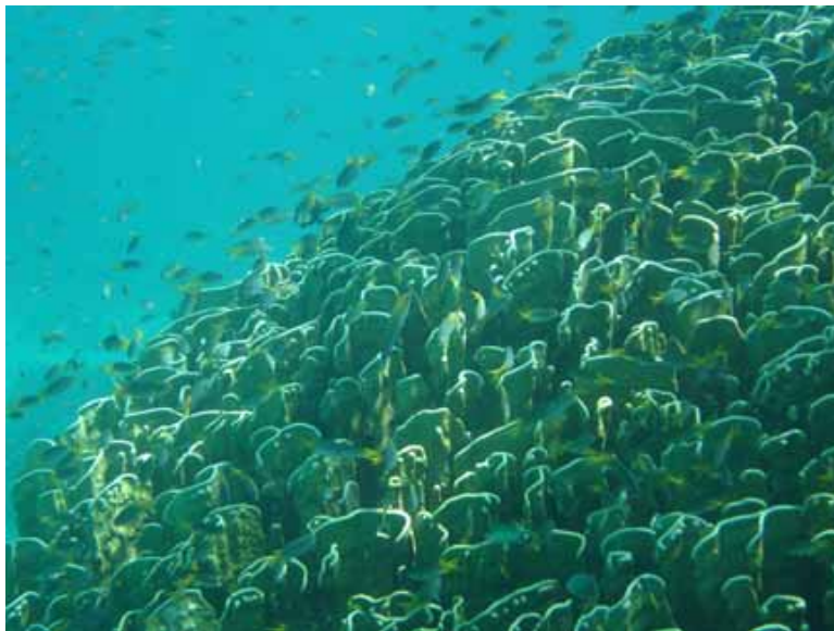
School of fish in a healthy reef.

catch-all of increasing biodiversity and awareness.